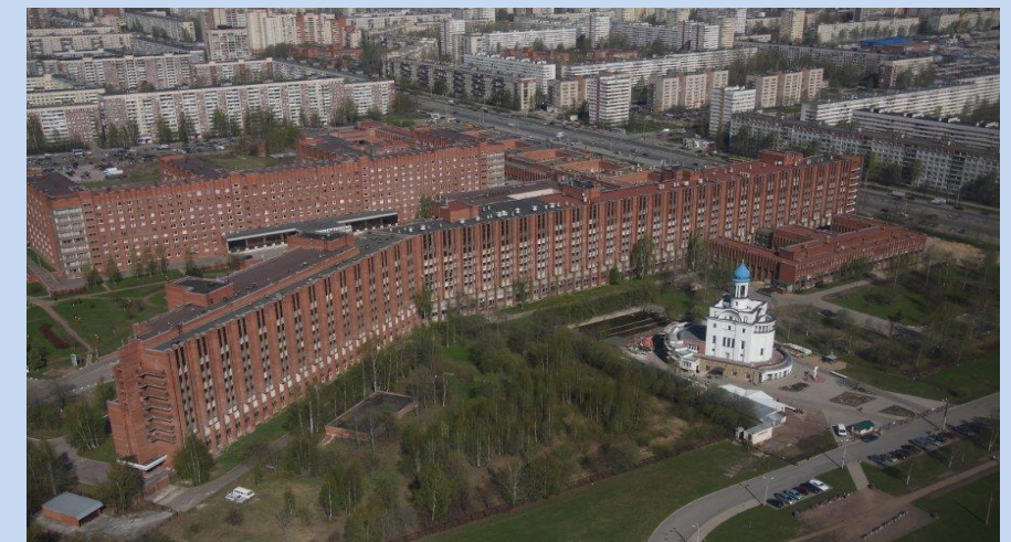
State Budgetary Healthcare Facility “Clinical Hospital of LO”