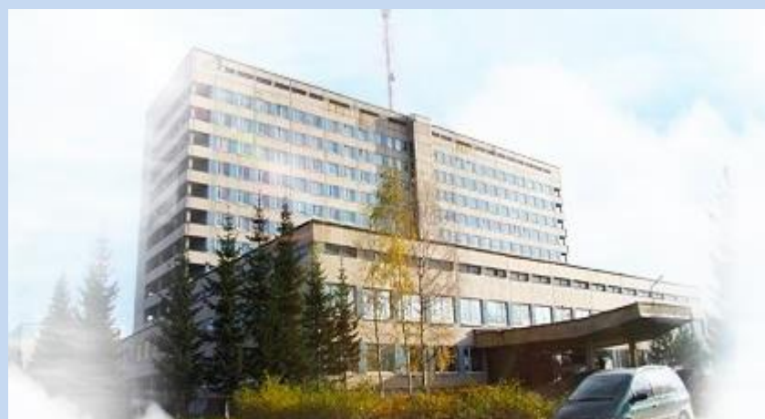
State Budgetary Healthcare Facility of LO “Interregional hospital of Tikhvin”