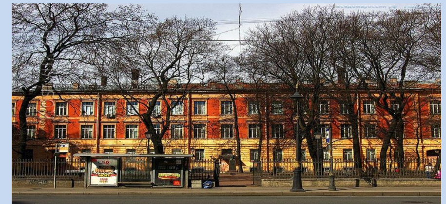
State Budgetary Healthcare Facility “Clinical oncological dispensary of LO”