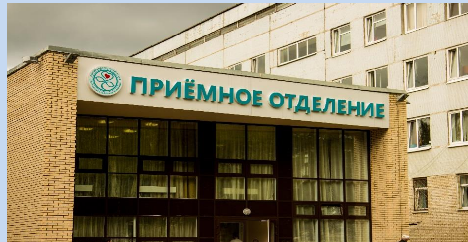
State Budgetary Healthcare Facility of LO “Interregional clinical hospital of Vsevolozhsk”