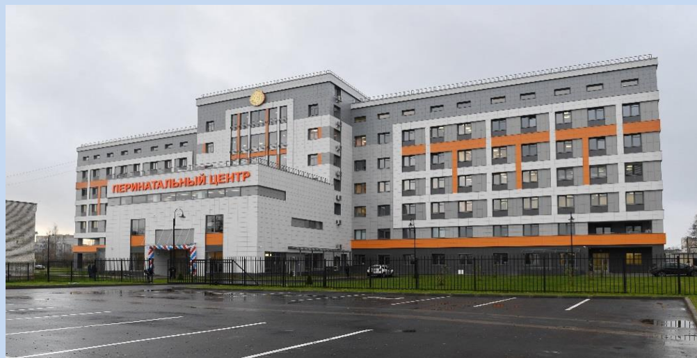
State Budgetary Healthcare Facility of LO “Interregional clinical hospital of Gatchina” (Perinatal center)