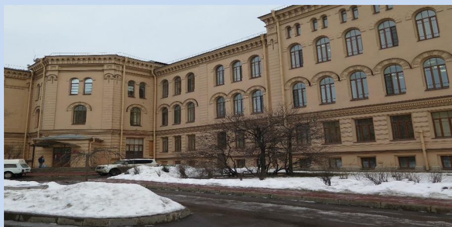
State Budgetary Healthcare Facility of LO “Children's clinical hospital “